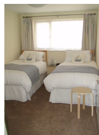
Bedroom 2 with twin 3' beds