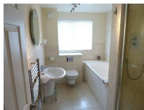
The bathroom with large shower