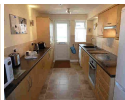
Kitchen—well equipped with fridge freezer, induction hob, combi microwave, fan oven, washer dryer