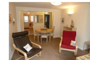
Living/Dining room—with 32" TV, Humax PVR, Blu-Ray player and Internet Radio